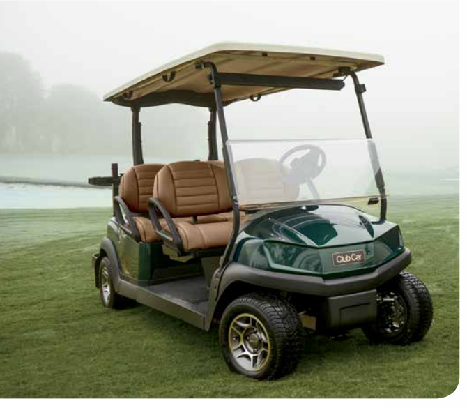
Tempo 4Fun – Built for 4 passengers

Designed with automotive styling and features that feel like upgrades, the brand-new Tempo and Tempo 4Fun represent the very best of Club Car: proven engineering, industry-leading durability, and reliable comfort. Plus, available connected technology that monitors fleet performance gives you the freedom to manage your operations from the course, not an office.