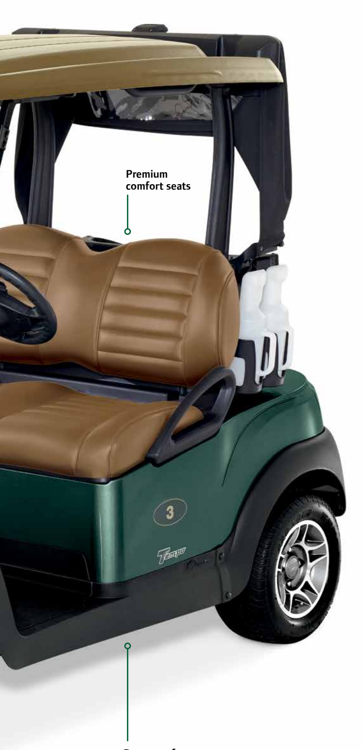
Rust-proof aluminum frame