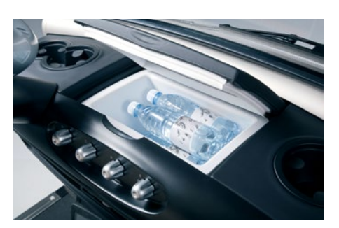
OPTIONAL REFRIGERATOR IN DASHBOARD

Treat your customers to a piece of luxury with a built in refrigerator, eliminating the need for ice , and reducing water water drain spills